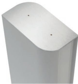
Brushed Aluminium Ends ▲

There is a very ample variety of formats to choose from.